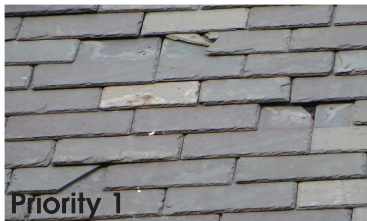
Restore roof. Estimated Cost - $200,000