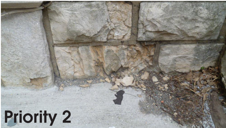
Priority 2 Tuck point church. Estimated Cost – $200,000