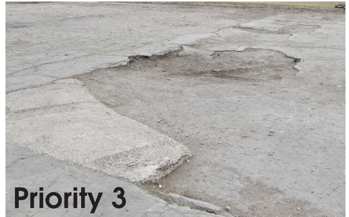
Priority 3 Grade and resurface parking lot. Estimated Cost – $150,000